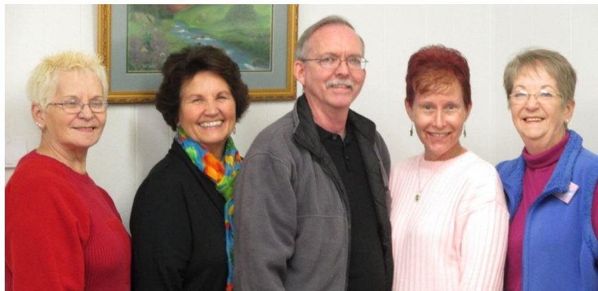
Palette Art League 2016 Officers