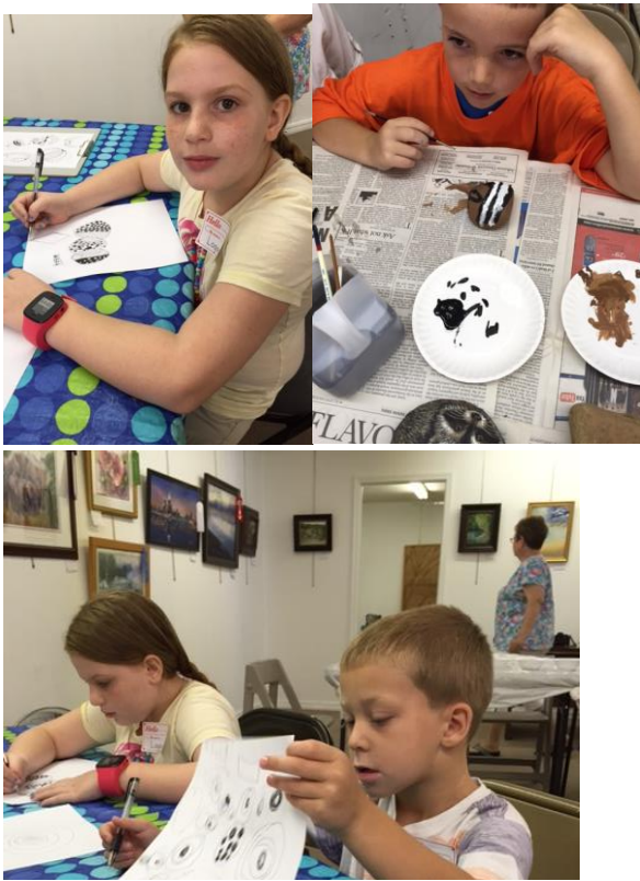
2015 Summer Kids Art Camp all stars.

Join the PALs Business meeting, second Friday each month, 3:00 p.m. Followed by "Meet the Artist Reception" 4-6 pm.