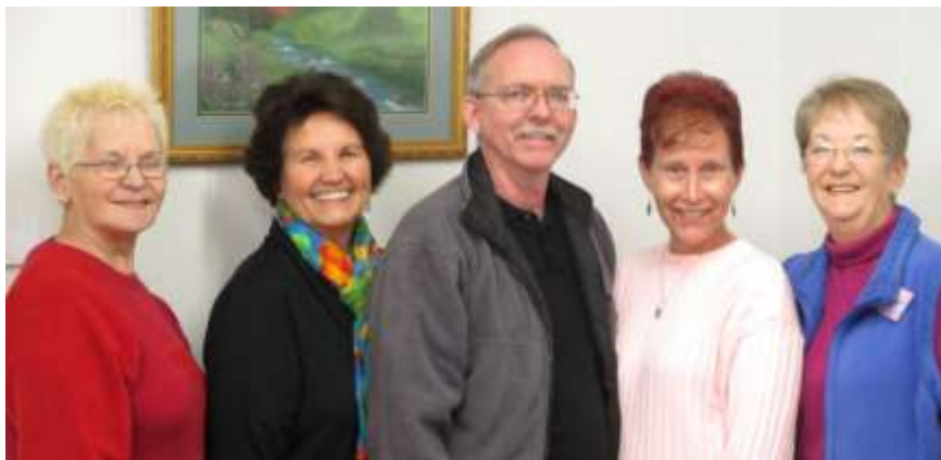
Palette Art League 2015 Officers

Experience an array of new original creations and meet the artists.